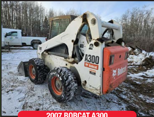
2007 BOBCAT A300