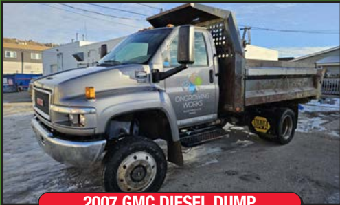
2007 GMC DIESEL DUMP