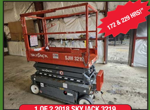
1 OF 2 2018 SKYJACK 3219