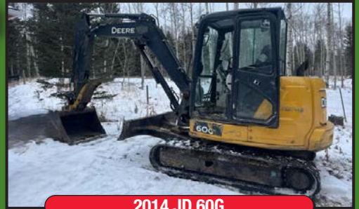
2014 JD 60G