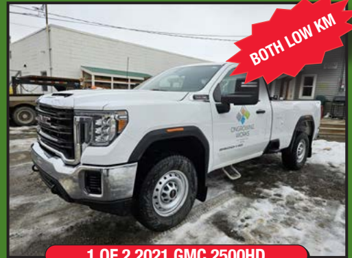
1 OF 2 2021 GMC 2500HD