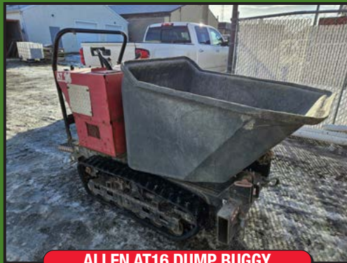
ALLEN AT16 DUMP BUGGY