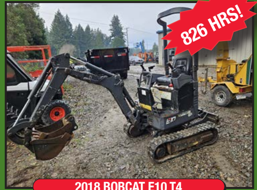
2018 BOBCAT E10 T4