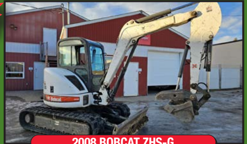
2008 BOBCAT ZHS-G