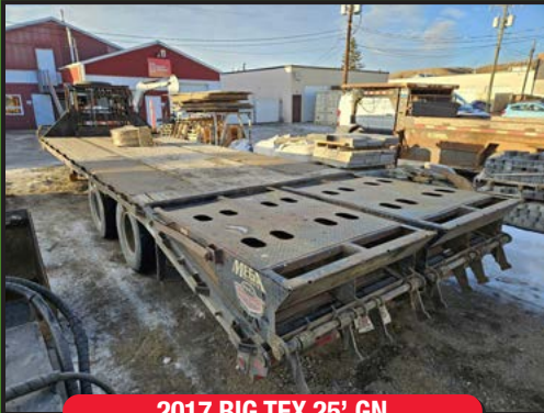
2017 BIG TEX 25' GN