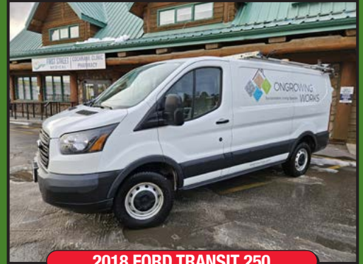
2018 FORD TRANSIT 250