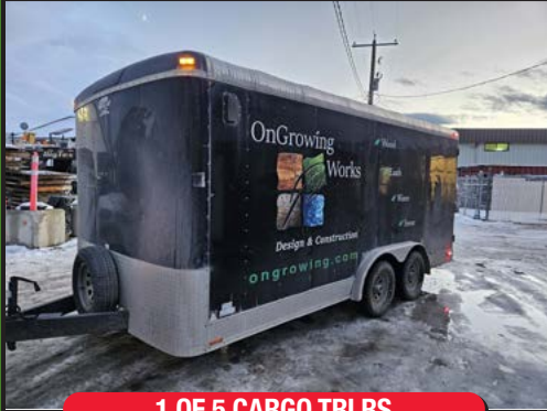
1 OF 5 CARGO TRLRS