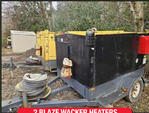
2 BLAZE WACKER HEATERS