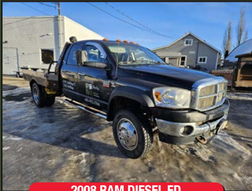
2008 RAM DIESEL FD