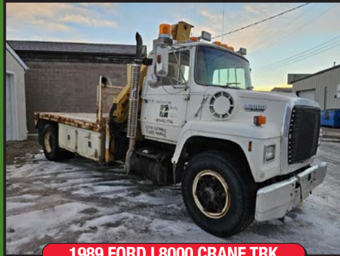
1989 FORD L8000 CRANE TRK