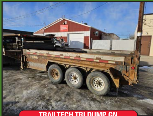
TRAILTECH TRI DUMP GN