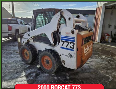
2000 BOBCAT 773