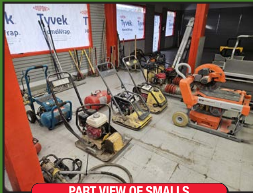
PART VIEW OF SMALLS